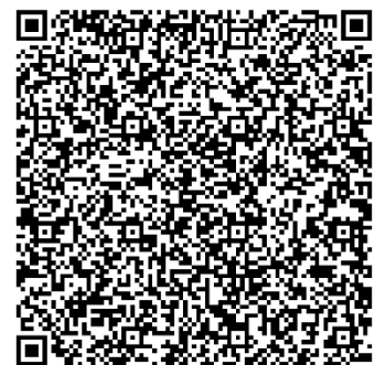
SCAN FOR FREE RWIT MEMBERSHIP